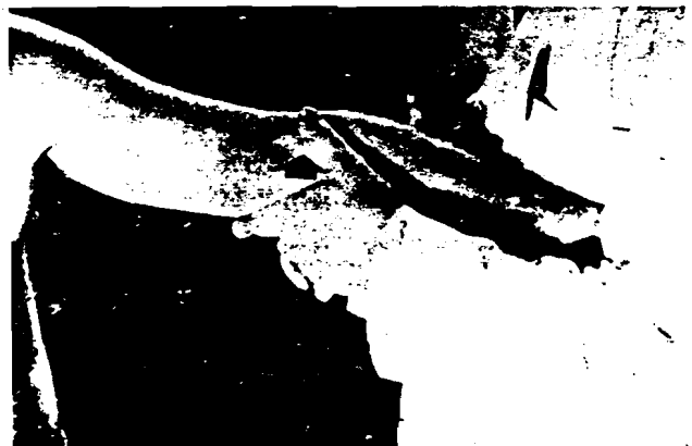
Fig. 1 (left). Abduction of the humero-ulnar joint. Fig. 2 (right). Adduction of the humero-ulnar joint.