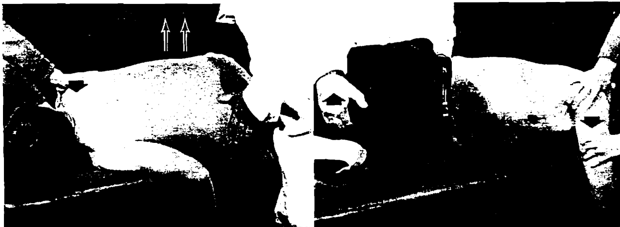
Fig. 5. The position of the hands of the two operators as one gets ready to rotate the pelvis to the right about the left oblique axis of the sacrum. Left, view from the back; right, view from the front.

ator places the patient in a modified left lateral Sim's position. The operator flexes and extends the knees and hips until the forces are localized at the lumbosacral junction. He produces sidebending to the left, rotation to the left, and backward bending of the spine at the lumbosacral junction. When all vectors of force are localized at the point where motion of L-5 is restricted, the operator applies a high velocity-low amplitude force to "free-up" the joint. Most of the time this type of osteopathic lesion or joint strain can be effectively treated by functional forces without anesthesia. Usually this can be done with little discomfort to the patient and minimal effort on the part of the operator.