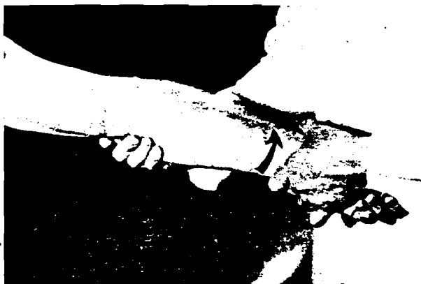
Fig. 3 (left). Pronation of the forearm with rotation of the radius about the ulna. Fig. 4 (right). Supination of the forearm with the radius becoming parallel to the ulna.